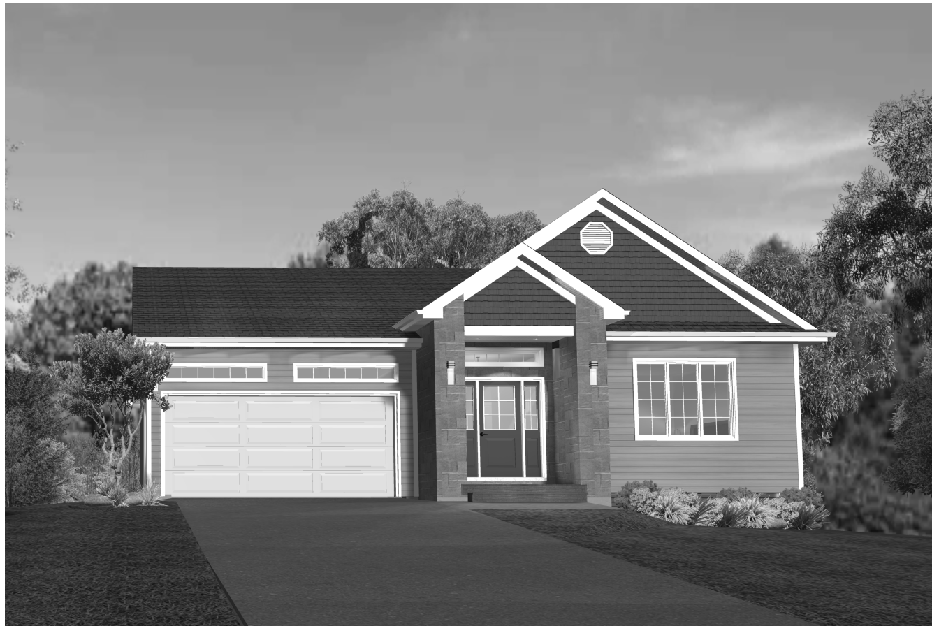
Renderings are artist's concept only E. & O. E. Integrity Homes Limited 2024