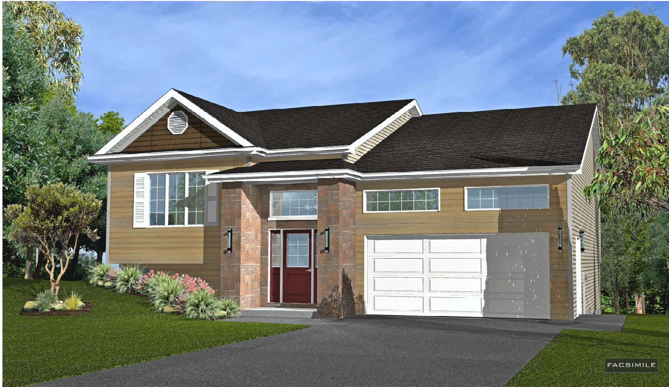
Renderings are artist's concept only E. & O. E. Integrity Homes Limited 2024